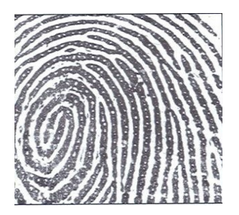
Figure 3: intra-ridge details – Sweat pores