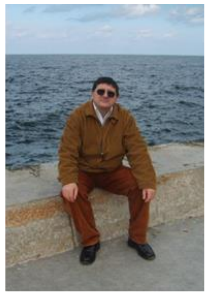
The author by the Mediterranean Sea, July 2006