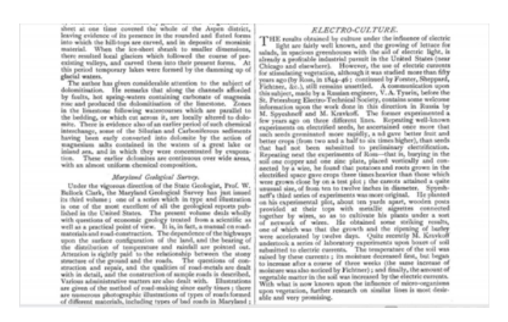
Figure 1: Coverage on electroculture in Nature, 1900.

In April 16, 1900, there was a Nature magazine edition, mentioned about electroculture: