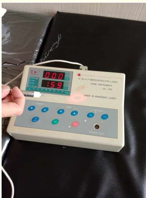
Figure 1: Laser pointer for acupuncture therapy.

One of our friends, a doctor, told us how laser LED therapy is quite commonly used in his practice of laser-based acupuncture. Several treatments which often use laser acupuncture methods including but not limited to: stroke, removing tatoos, skin rejuvenation, facial/ ageing problems etc. There is also hope for treatment of degenerative problems with this method, such as Alzheimer and Parkinson diseases too.