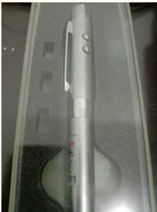
Figure 2: Laser LED pointer.