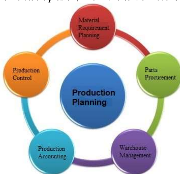
Fig. 1: Model for PP and control

The PP challenge has selected various machinery types for the manufacturing process: lathe, milling machine, grinder, jigsaw, band saw, and drill press. The main objective of the production industry is to make profit so that the company runs smoothly. It is always advisable for a company to prepare a production plan based on scientific methods to get a clear direction for how the production process should be carried out. The main objective of this study is to optimize the profit, product liability, quality, and satisfaction of workers. The input information such as, the available facilities and resource information, the units of machine available for the manufacturing items, and the number of hours spent using the machine to produce the product, including production machinery is required to formulate the problem. The PP and control model is shown in Figure 1.