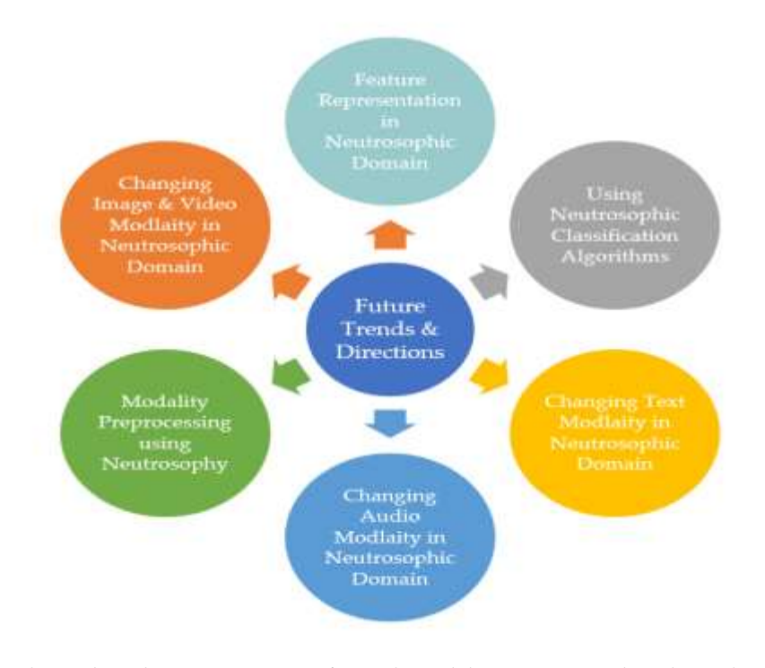
Figure 3 Potential Trends and Future Directions for Multimodal Fusion Research and Development Using Neutrosophy

Based on our literature investigation and analysis of more than 80 articles, various research trends, research directions, and potential research topics are drawn for handling imperfections in multimodal fusion research and development. Though the direct handling of imperfection at the fusion stage will not yield fruitful results, we recommend handling imperfections at each stage starting from selecting data sources and collection of data in different modalities to fusing the features together. The procedure involved in this is summarized in the following Figure 3.